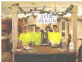
Winners at JOB's Booth BIE Home Show 2010